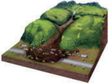
Fig. 6. Mud fluid forming schematic drawing

Fig. 5. Burying road and tunnel for mud fluid indirect flood damage (Fig. 5). The reason that the mud fluid cause huge harm is mainly because its disintegration, the transporting, and the deposition is extremely intense and changing surface of the ground is very big. The mud fluid mainly include such two kinds of as the coherent mud fluid which refer to the solid matter occupy 40% above total quantity of mud fluids, and the thin mud fluid which refer to the solid matter occupy 40% total quantity of mud fluids.