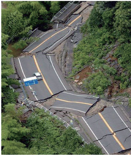
Fig. 3. Road failure caused by landslide

belt. The landslide is one geological disaster which is met frequently in the mountain road construction (Fig.3). The landslide generally is composed by such three major parts as landslide wall, the sliding surface and the landslide mass (Fig. 4). The large-scale landslide mass's structure is quite complex, its front end is the landslide tongue and the landslide drumlin. In the landslide mass there are landslide terrace, basin, lake, crack etc. The harm degree of landslide varies with the scale of it, the large-scale landslide's harm is quite serious, may amount to even several billions cubic meters, destroy the road, jam the river course, deposit the reservoir, and the landslide origin is as follows.