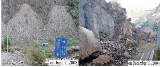
Fig. 1. Disruption traffic for Collapse

The collapse predominant type includes: falling rocks, landslide, bank failure, collapses. The origin of inducing collapse is as follows (Fig. 2):